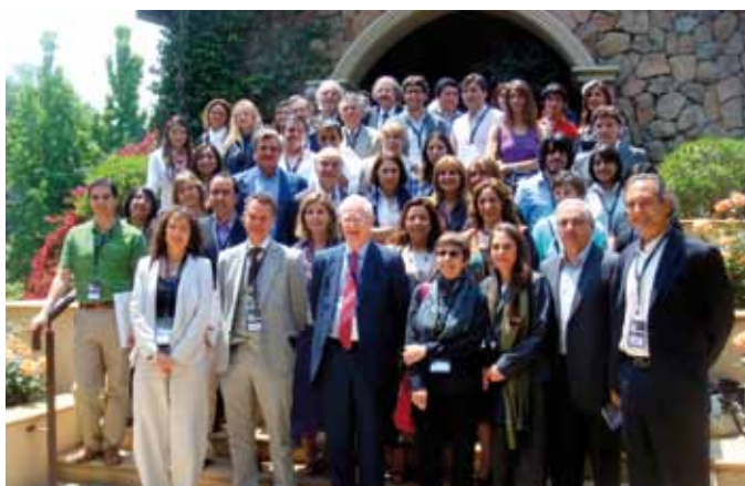
Delegates at the Santiago meeting

A Bioethics Symposium was held in Santiago, Chile from 11-13 November. It was supported by the Chilean Society of Reproductive Medicine, The Chilean Society of Obstetrics and Gynecology, the Chilean Institute of Reproductive Medicine, the Red Latinamerican Society of Assisted Reproduction, the Pan American Health Organisation, WHO and IFFS and attended by up to 160 delegates. The reason for holding the Symposium was that there has been considerable pressure from faith-based organisations to restrict ART services. This followed the example of Costa Rica, which has been the only country in the world to ban all ART.