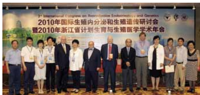
Opening ceremony in China

The main Congress was attended by about 400 delegates. This was not really a Workshop in the usual sense, as the Chinese wish to be more involved with the global scientific community. The Congress was opened by a Ministry official in an elaborate opening ceremony. There were two other invited speakers who contributed, apart from the four IFFS invitees. There was double projection as all invited speakers' slides had been submitted earlier and translated into Chinese by various students. Both English and the Chinese translations were projected and the preliminary English speeches were translated into Chinese. The main presentations were not translated from the English. Copies of all slides of the main speakers and abstracts in Chinese for the remaining speakers were available to all participants. The meeting was well supported locally, principally by Merck Serono but also other smaller local