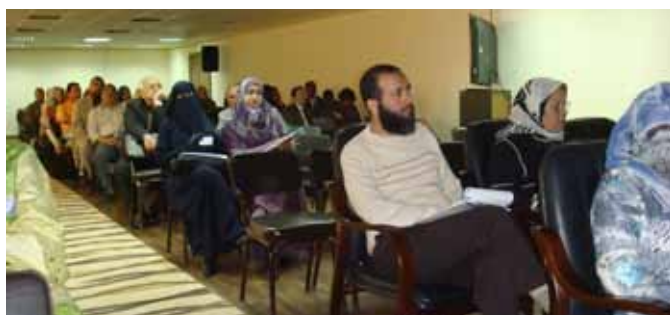
Part of the audience watching screens at the streaming video conference transmitted from the Royal College of Obstetricians and Gynaecologists in London at the Suzanne Mubarak Center, Alexandria, Egypt.