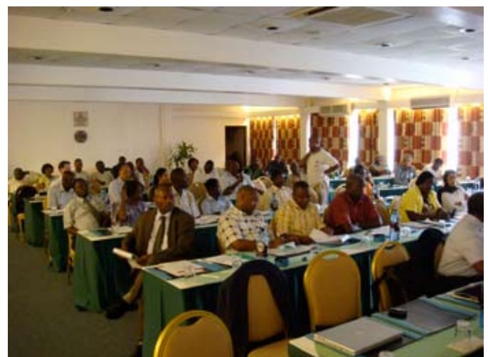
Question time after a presentation: the audience at the Joint IFFS/ Kenya Obstetrical and Gynaecological Society (KOGS) meeting held in Mombasa, Kenya